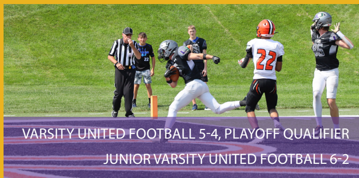
VARSITY UNITED FOOTBALL 5-4, PLAYOFF QUALIFIER JUNIOR VARSITY UNITED FOOTBALL 6-2