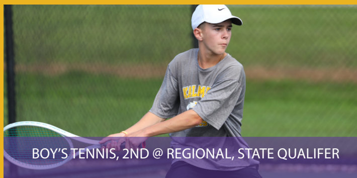
BOY'S TENNIS, 2ND @ REGIONAL, STATE QUALIFIER