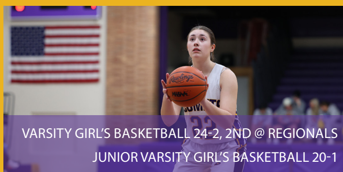
VARSITY GIRL'S BASKETBALL 24-2, 2ND @ REGIONALS JUNIOR VARSITY GIRL'S BASKETBALL 20-1