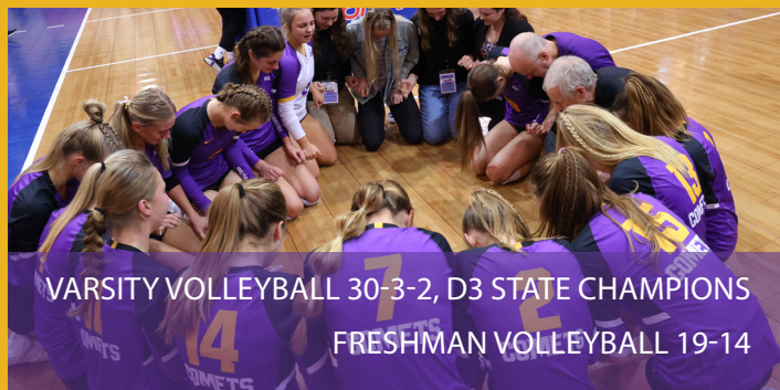
VARSITY VOLLEYBALL 30-3-2, D3 STATE CHAMPIONS FRESHMAN VOLLEYBALL 19-14