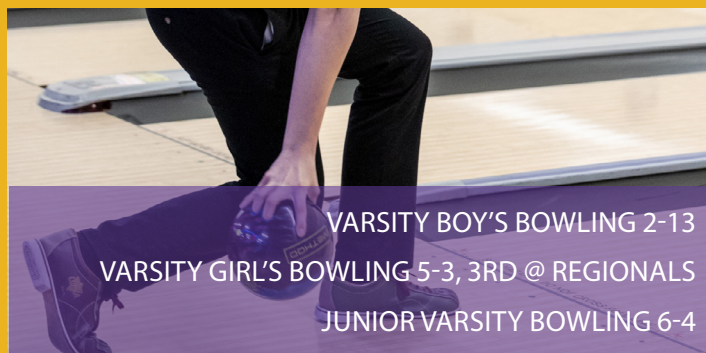
VARSITY BOY'S BOWLING 2-13 VARSITY GIRL'S BOWLING 5-3, 3RD @ REGIONALS JUNIOR VARSITY BOWLING 6-4