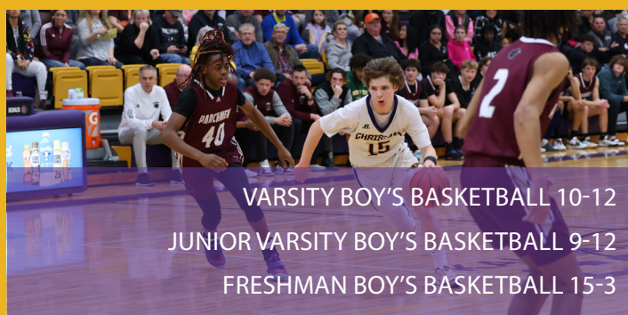
VARSITY BOY'S BASKETBALL 10-12 JUNIOR VARSITY BOY'S BASKETBALL 9-12 FRESHMAN BOY'S BASKETBALL 15-3