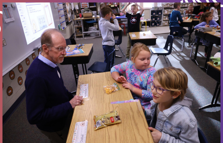
Pastor's chapel is where we're joined by families and local pastors in community.