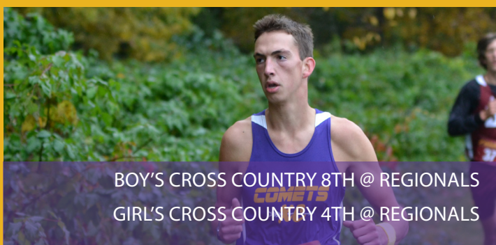
BOY'S CROSS COUNTRY 8TH @ REGIONALS GIRL'S CROSS COUNTRY 4TH @ REGIONALS