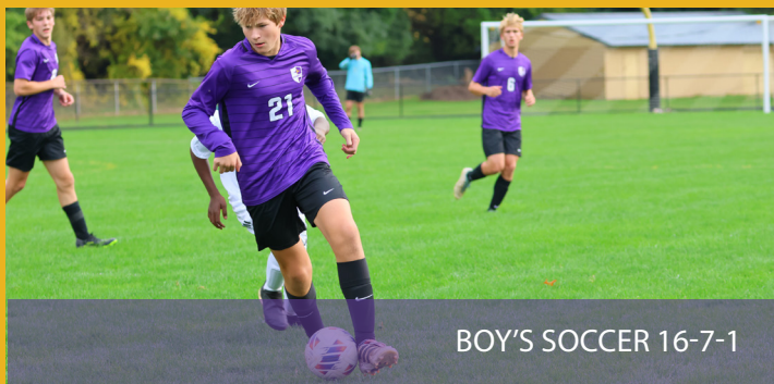
BOY'S SOCCER 16-7-1