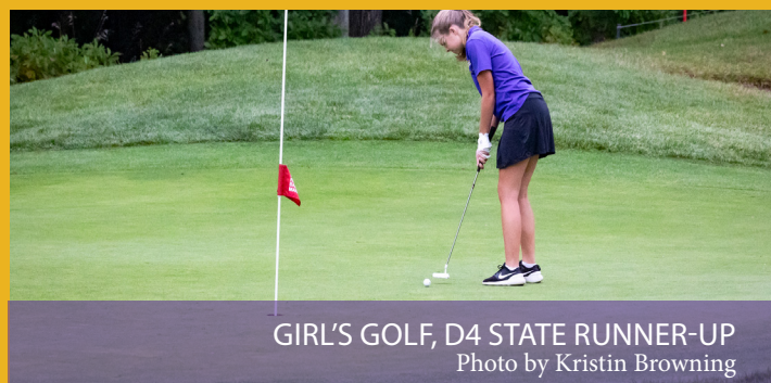
GIRL'S GOLF, D4 STATE RUNNER-UP